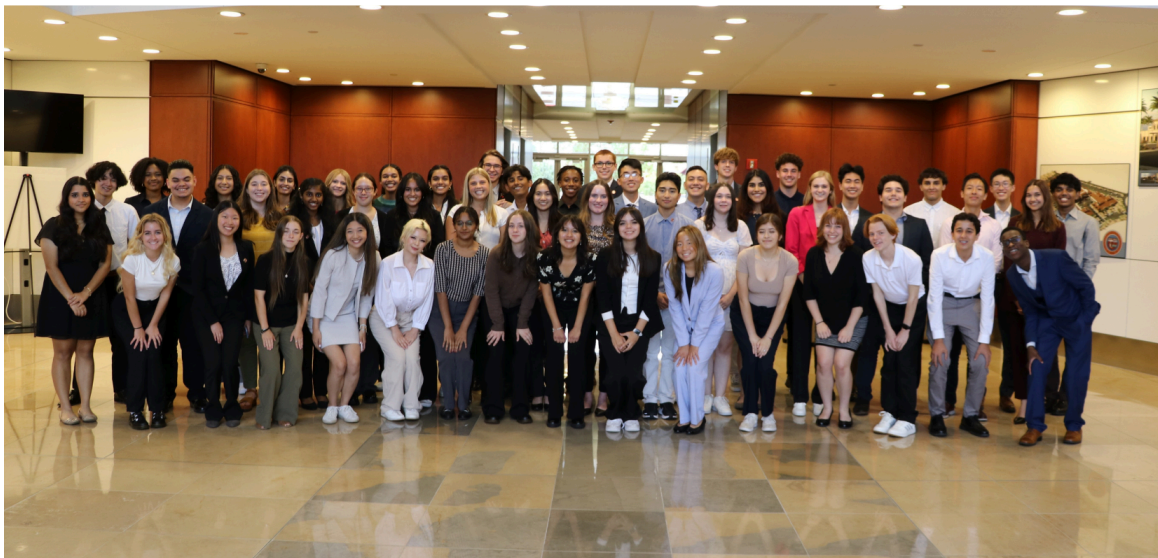
2023-2024 Governor's Youth Commission Orientation/Quarter 1 Meeting