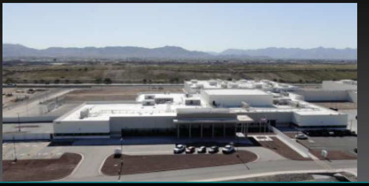
Intake, Transfer, and Release (ITR)