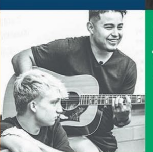
Parent & Faculty Education