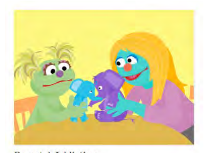
Parental Addiction In this webinar, content creator Kama Einhorn walks us through the Parental Addiction topic page. She shares key messages and offers ways you might use these resources in your work with kids and families.

Short 10 minute videos to instantly level-up your knowledge about a specific topic. These videos include tips for talking to families.