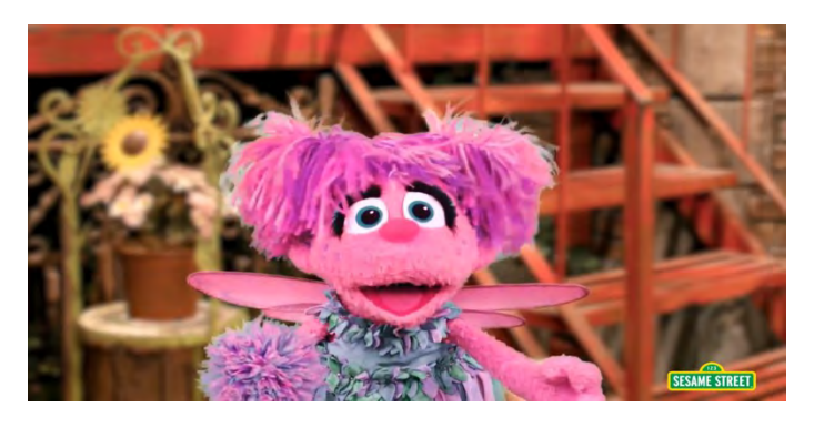
ABC's & 123's