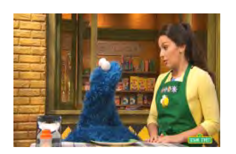
Healthy Bodies, Healthy Minds