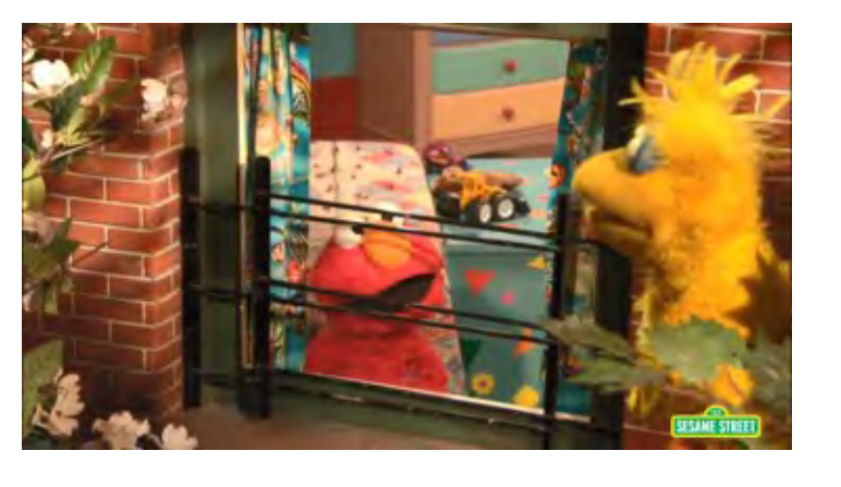
Difficult Times & Tough Talks