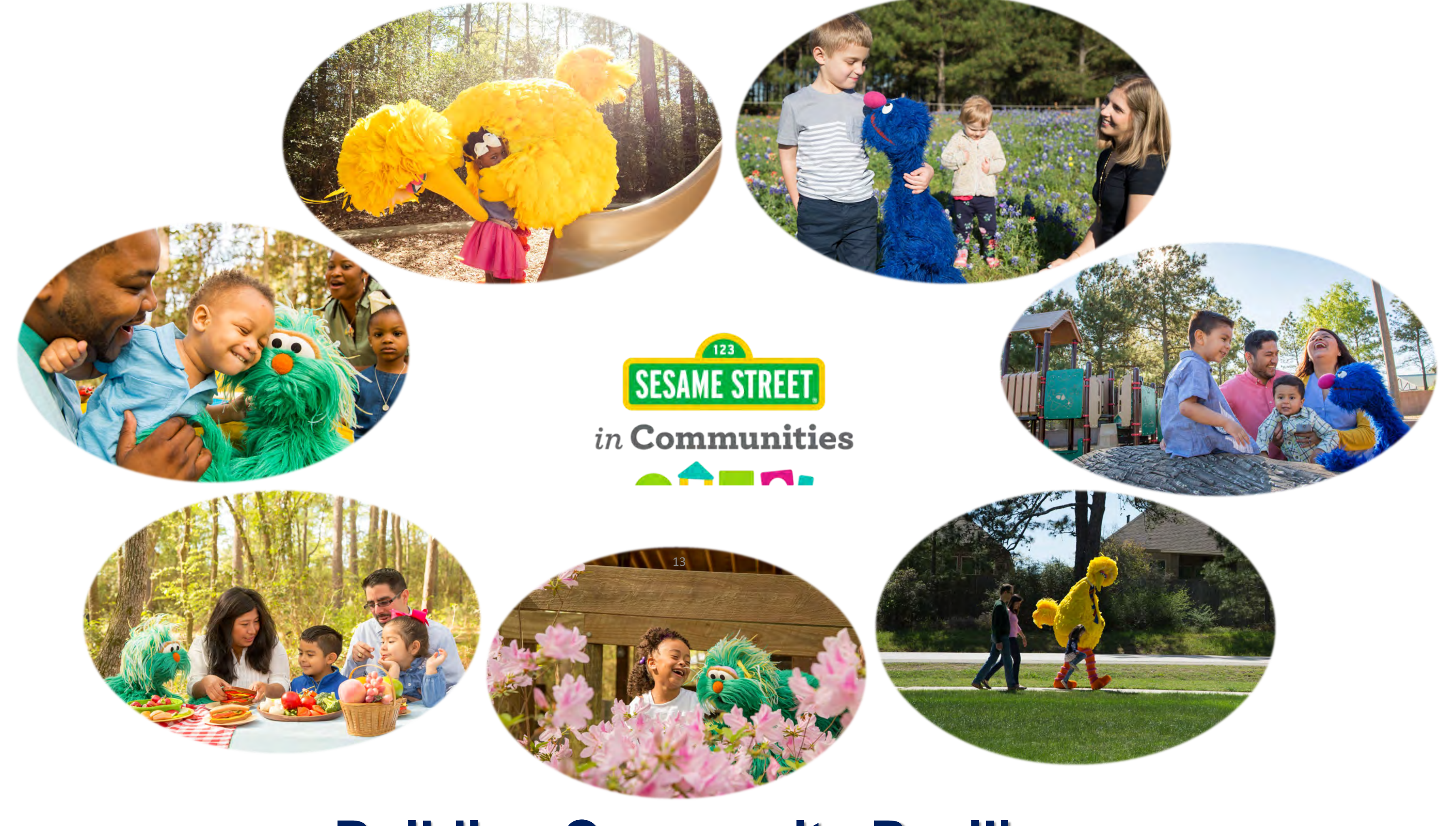
Building Community Resilience