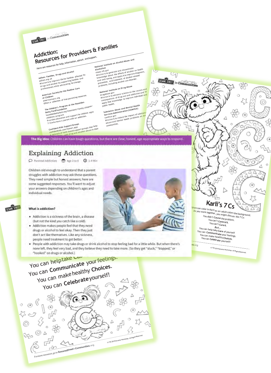
Printables & Articles