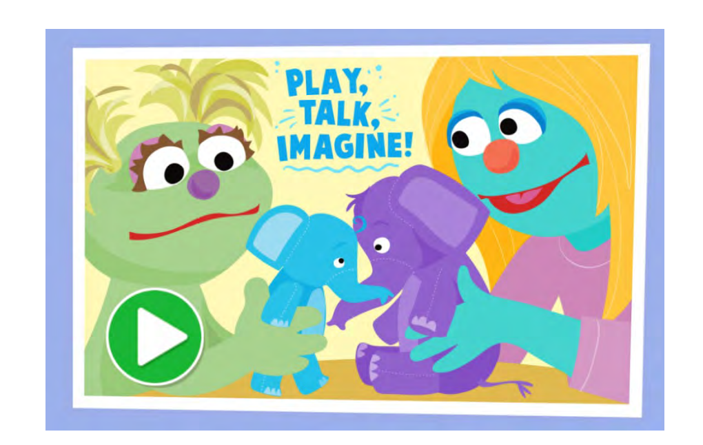
Digital Storybook featuring Karli