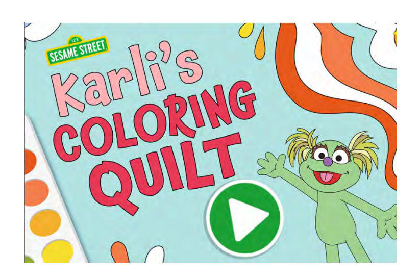
"Karli's Coloring Quilt" Interactive